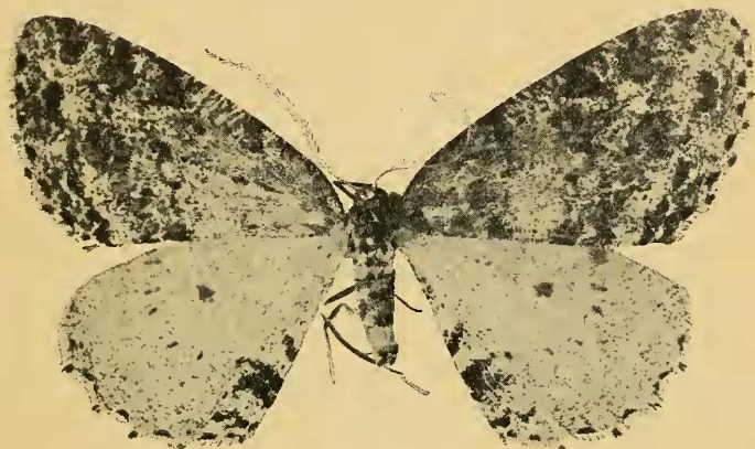
Fig. 5. Ectropis inversa n. sp. holotype ♂ (× 2).